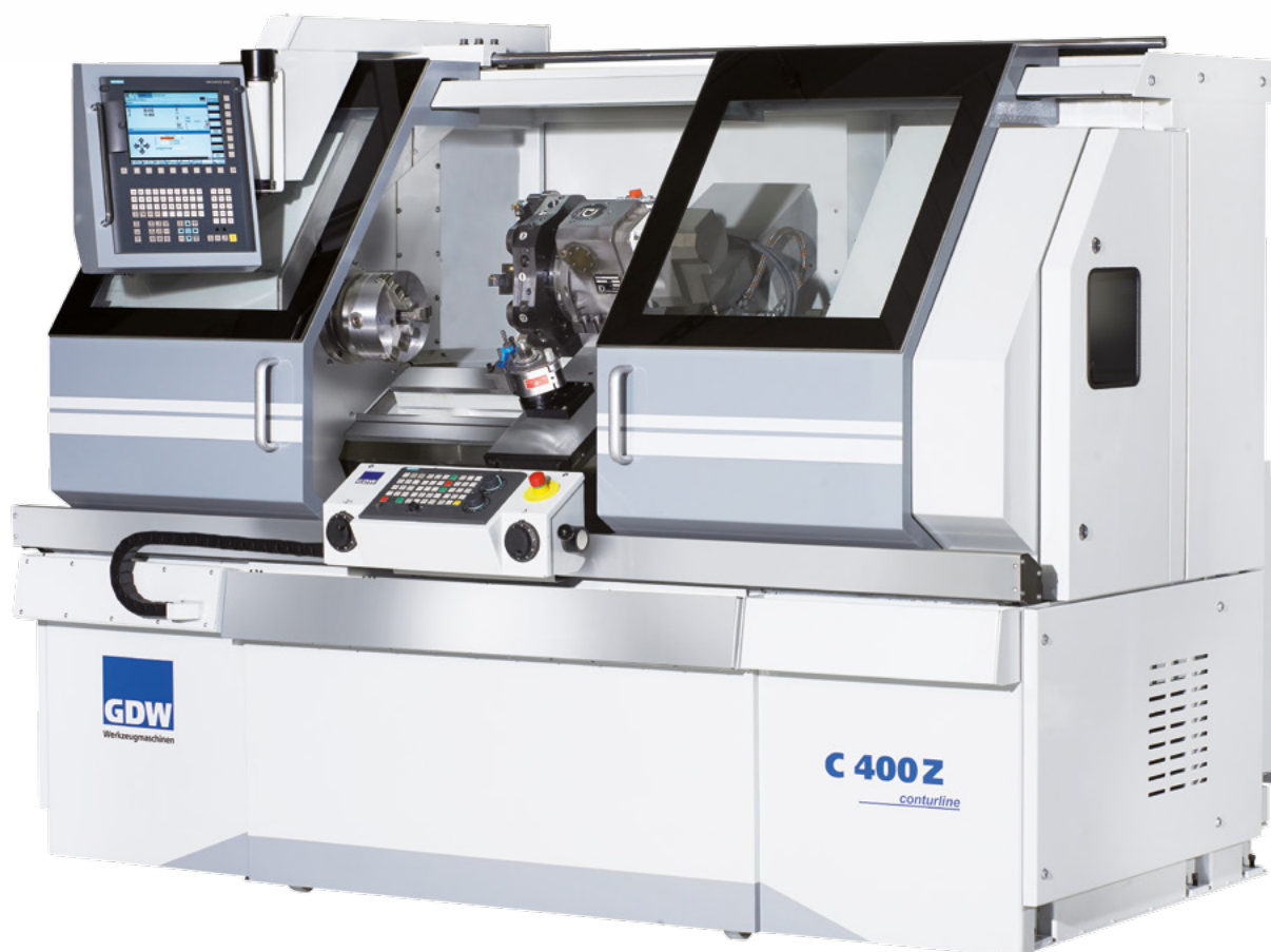
figure with special equipment

Ergo-Contoured Computer-Aided Precision Engine Lathe